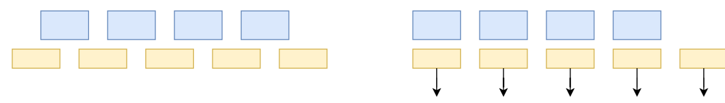
B-Tree with non-unique values